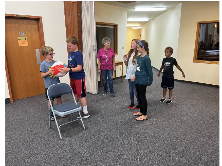
Chalk Art and Games by the kid's at Children's Choir